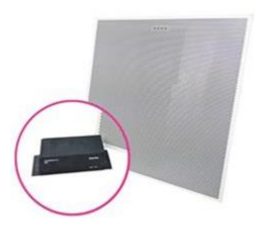
The new Versa Lite CT from ClearOne is a perfect fit for small-to medium-sized video-enabled rooms.

SALT LAKE CITY, June 02, 2020 (GLOBE NEWSWIRE) -- ClearOne (NASDAQ:CLRO), announces worldwide shipping of its new COLLABORATE<sup>®</sup> Versa Lite CT, featuring a USB-audio enabled Beamforming Ceiling Tile Microphone Array (BMA CTH). This great room solution dramatically enhances the audio experience for any cloud-based video collaboration application such as COLLABORATE Space, Zoom<sup>™</sup>, Microso<sup>®</sup> Teams, and Webex<sup>™</sup>, without the need for a DSP mixer. It's finally here!