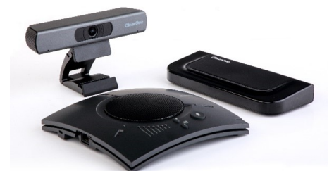
ClearOne Aura Versa 50 complete collaboration solution includes an ePTZ camera, CHAT 150 speakerphone, and Versa 6 port USB Hub