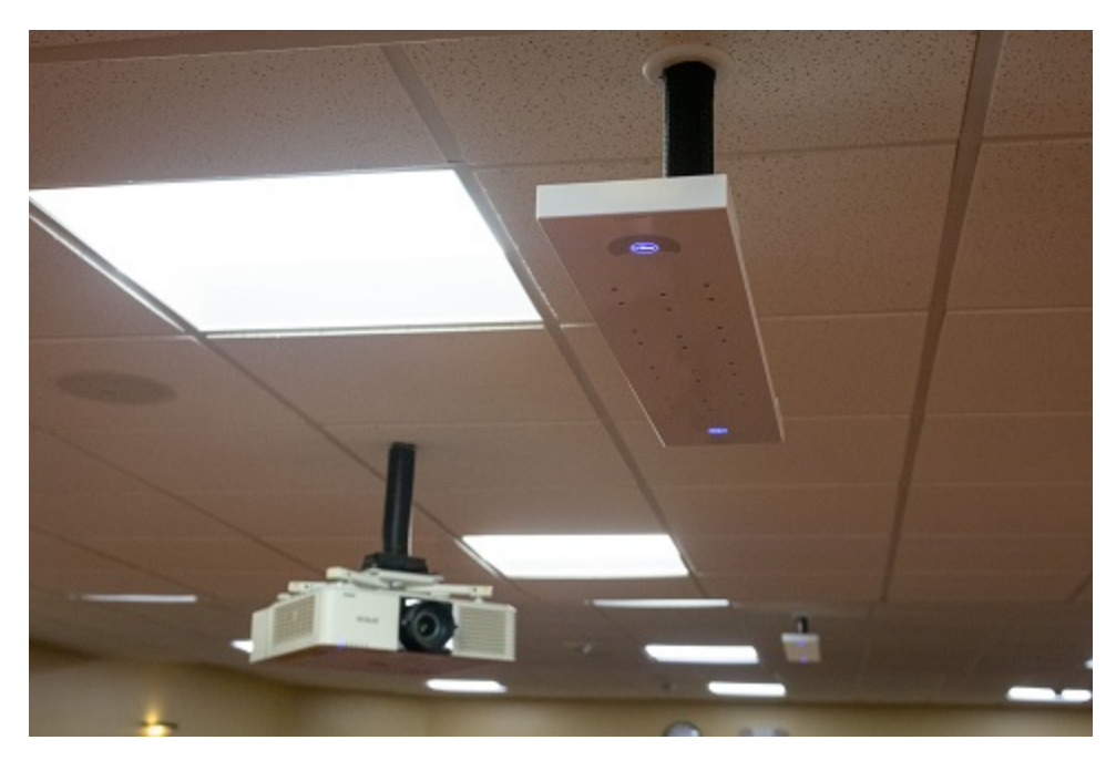
The BMA2's ultra-sleek design fits into any conferencing environment and delivers the clearest audio pickup available with its Acoustic Intelligence.

The college also plans to install BMA360 beamforming microphone arrays and the Unite 200 Camera in the physics lab of the new science center, which broke ground last summer.