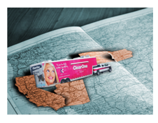
The ClearOne Re-Connections Tour will take its tech showcase to innovation-hungry resellers in New Mexico, Northern California, and the mighty Midwest states of Nebraska, and Iowa in May.